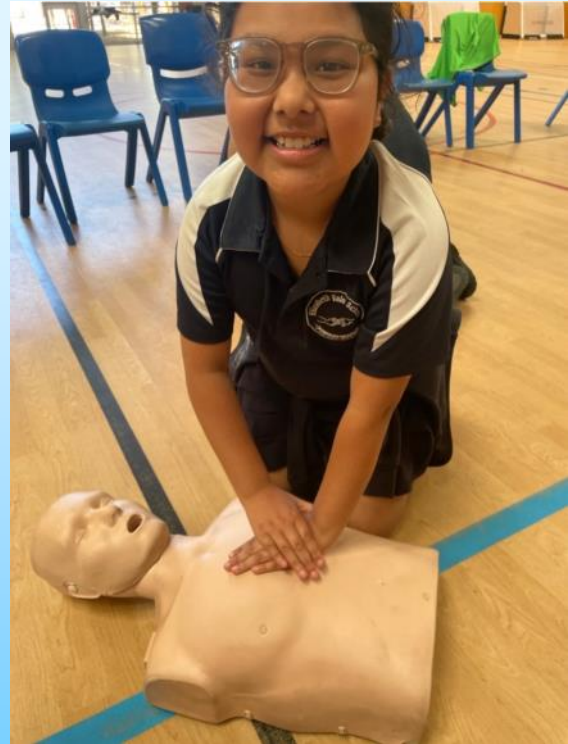
First Aid training last week ran by St Johns

Did you know that you always need to tell the person what you are doing? For example “I am going to help you rest, okay” Sabin-Room 5